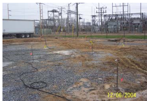
Injection Wells at the Site

Site History: The site is a former petroleum underground storage tank area located in South Carolina contaminated with BTEX, MTBE and naphthalene. The site groundwater was initially treated using an air sparging system, which removed the majority of the contamination. However, after two years of air sparging, persistent concentrations of contaminants remained, predominantly in the central portion of the plume.